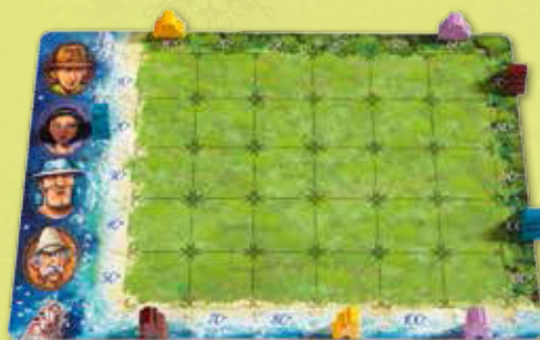
Here is what the islands could look like