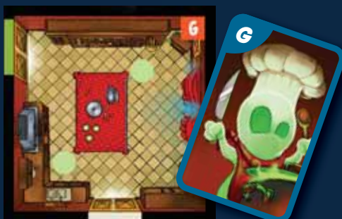
B - Matching Letters