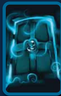
Blue "Door Locked" Card