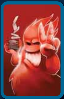
Draw 2 + Shuffle Card