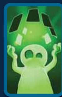
C - Shuffle Card