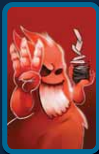
Draw 3 + Shuffle Card

The game proceeds as described in the BASIC GAME section, with the same goals in mind; however, if you draw a "DRAW 2 + SHUFFLE" or a "DRAW 3 + SHUFFLE," you must draw the additional number of cards indicated and place any Ghost Figures on the board, then shuffle the discard pile with the remaining draw pile (NOTE: IF, WHEN DRAWING THE 2 OR 3 ADDITIONAL CARDS, YOU HAPPEN TO GET ANOTHER SHUFFLE, DRAW 2 OR DRAW 3 CARD, YOU MAY IGNORE IT AND MOVE TO THE NEXT CARD).